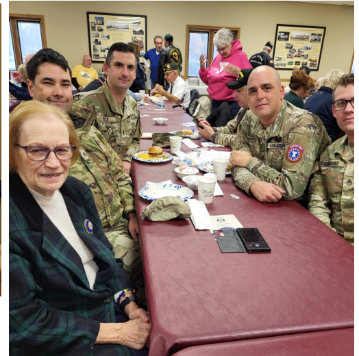
(Top Right) President Arlene Holtgrave with Army recruiters in Utica area at Veterans breakfast.