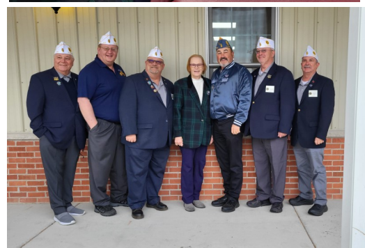
(Bottom Left) American Legion Family Leadership attending a tour of the Marion Illinois VA Facility.