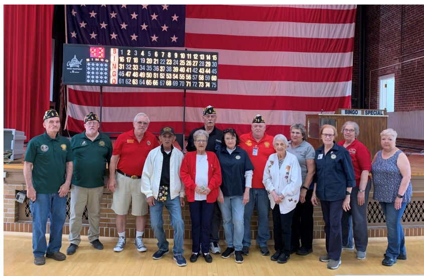
(Left) American Legion Family Leadership at the Haven Run.